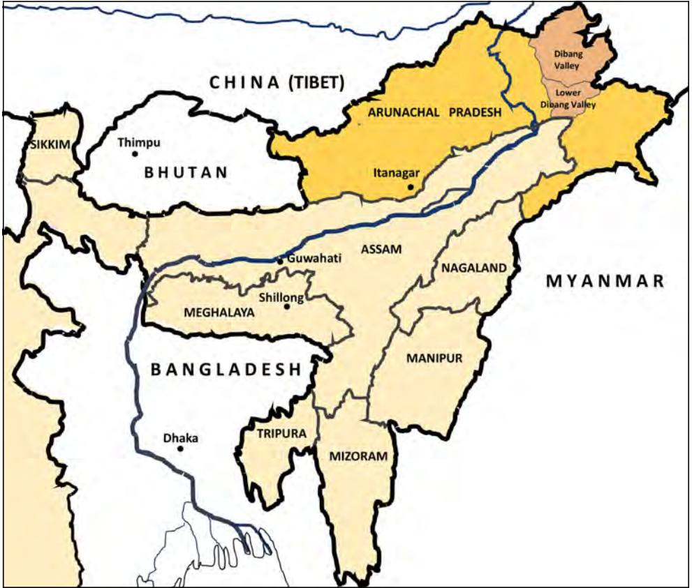
MAP 9.1 Lower Dibang Valley and Dibang Valley (brown) in Arunachal Pradesh (yellow) and (North-east) India (beige) (Credit: Rebecca Gnüchtel)

close to the Tibetan border (i.e. in the upper part of Dibang Valley). The Mithu, by contrast, traditionally live in the middle ranges about half way up into the mountains of Kera'a territory, today clustering in the areas in and around Hunli and Desali.